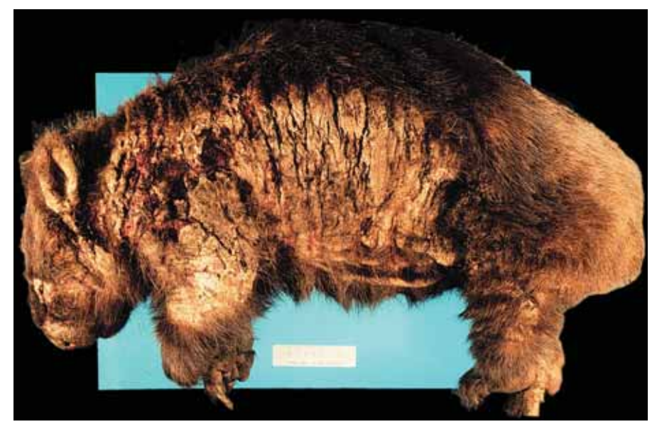
Figure 2. Adult, male common wombat (Vombatus ursinus), from Christmas Hills, Victoria with severe parakeratotic sarcoptic mange showing typical distribution of parakeratotic scale, hair loss and excoriation.

wombats <sup>4,7</sup>. In agricultural areas, where wombats are considered pests, epizootics of sarcoptic mange in wombats may be viewed by farmers as beneficial. However, epizootics of sarcoptic mange together with other concomitant causes of mortality, may lead to the extirpation of small, isolated wombat populations